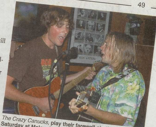
The Crazy Canucks, play their farewell gig this Easter Saturday at Malones in Surfdale.

They hope to return to Waiheke in the future. This Saturday they are playing from 8.30pm to midnight. Entry is free. •